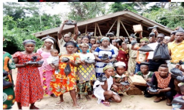
TAPPITA DISTRICT FOOD DISTRIBUTION