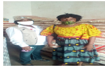
BASSA, ST. JOHN RIVER, RIVERCESS AND MORWEH DISTRICTS