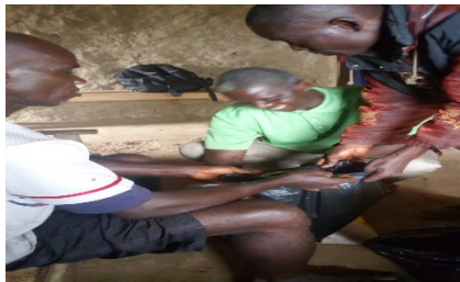
GEE RIVER DISTRICT